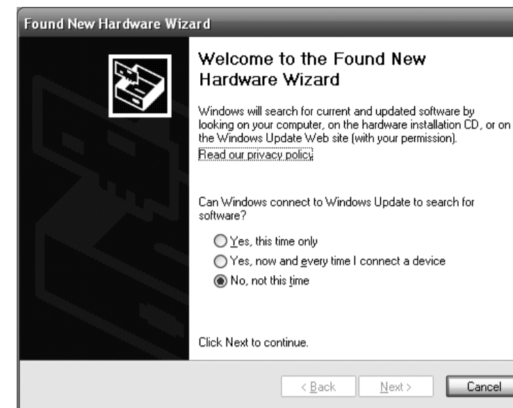
Found new hardware in Windows XP